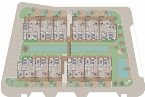
Planta primera / First floor