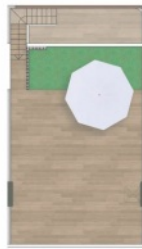
Planta solarium / Topfloor