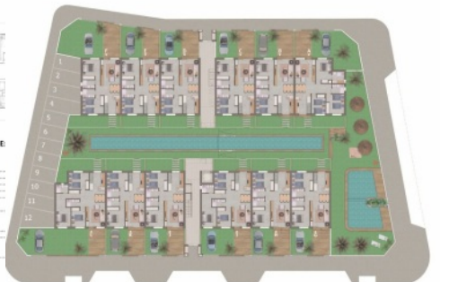
Planta Baja / Ground floor